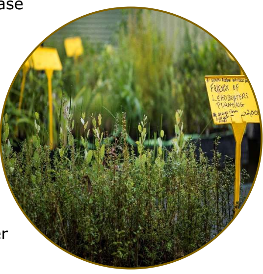
Figure 5: Indigenous nursery stock

Yarra4Life drives on-ground projects that increase protection and improve the condition and resilience of habitats – across both public and private land, including agricultural, horticultural, equicultural, viticultural and lifestyle properties – in the Yarra4Life area, to support a diverse range of flora and fauna, including our State's faunal emblems and indigenous and more climate resilient flora. Yarra4Life also works to increase the biodiversity values of these protected habitats through initiatives, involving corridors and other elements of connectivity, that can link these various habitats.