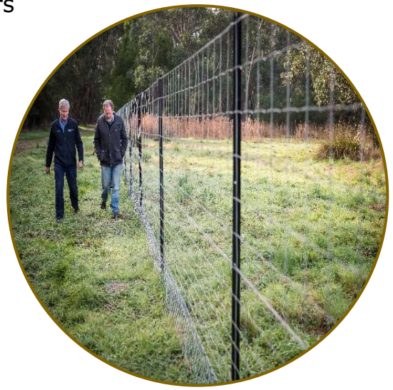
Figure 7: Deer proof fencing protecting habitat