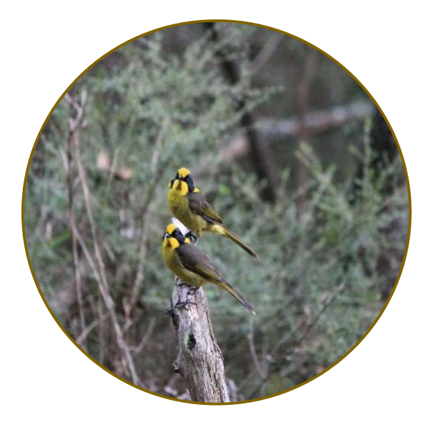
Figure 2: Helmeted Honeyeater

The Wurundjeri People take their name from the Woiwurrung language word 'wurun' meaning the Manna Gum (Eucalyptus viminalis) which is common along 'Birrarung' (Yarra River), and 'djeri', the grub which is found in or near the tree. Wurundjeri are the 'Witchetty Grub People' and our Ancestors have lived on this land for millennia.1