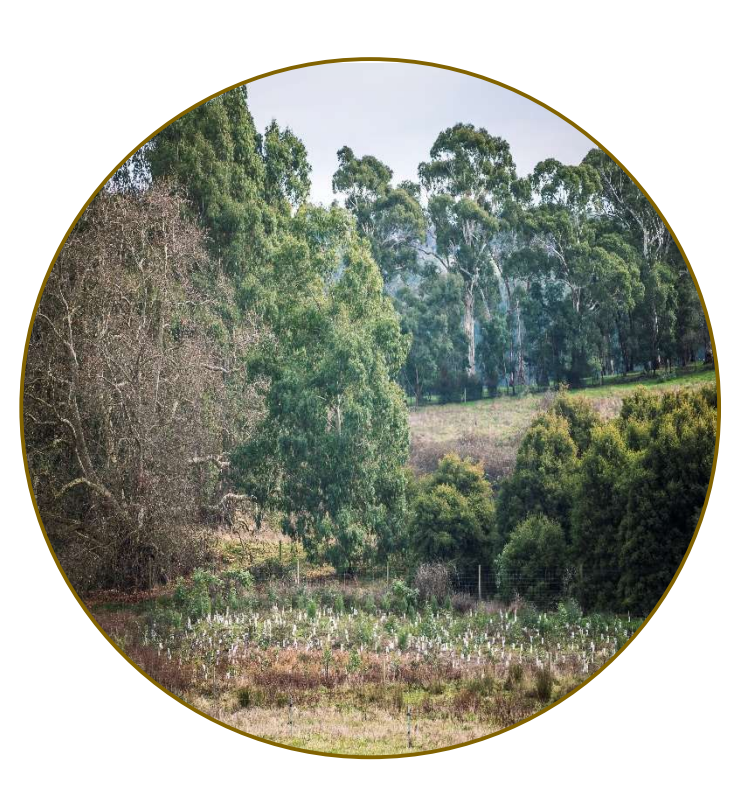
Figure 9: Yarra4Life supported rehabilitation