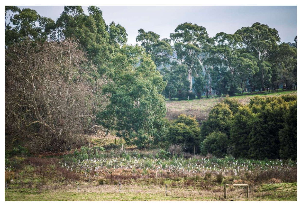
Figure 1: Yarra4Life planting

Yarra4Life seeks to provide a respectful and robust forum in which to share information and opportunities, with a focus on addressing gaps rather than replicating what our partners and other organisations and groups are already doing.