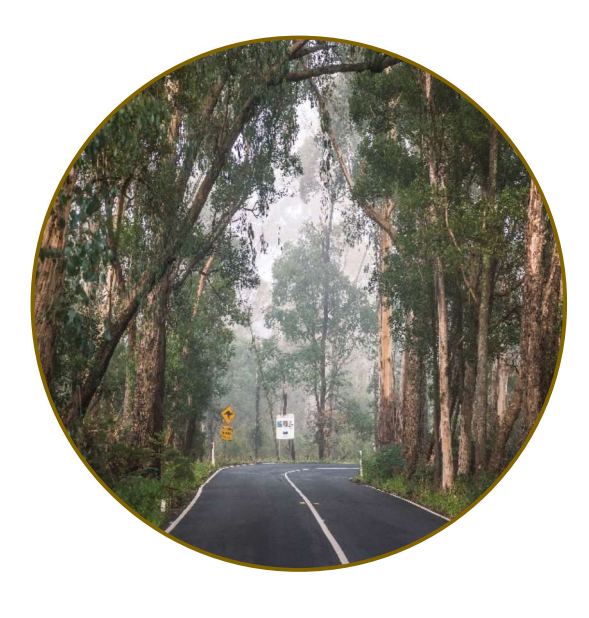
Figure 8: Yarra4Life landscape

As a medium-term action, Yarra4Life will pursue the development of an environmental monitoring framework to establish baseline condition and monitor change over time and progress towards our goals. This framework will seek to use existing data sets and established monitoring frameworks where appropriate.